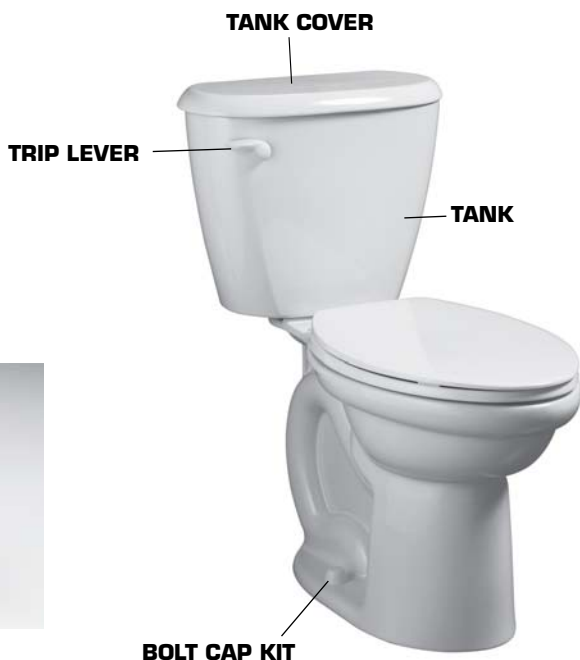
FLUIDMASTER 400A VALVE