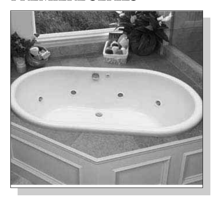
Genesis Whirlpool (015-5305). Bath waste not included.