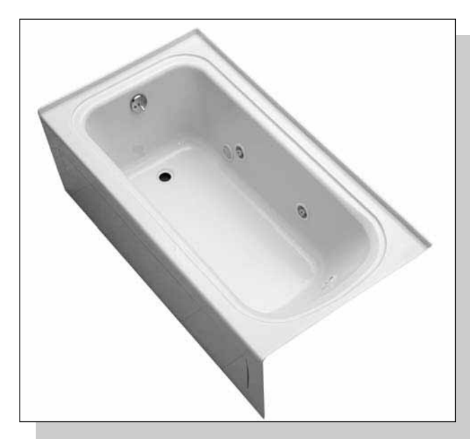
Patriot 4260 Whirlpool (015-0179) with Integral Skirt. Bath waste not included.