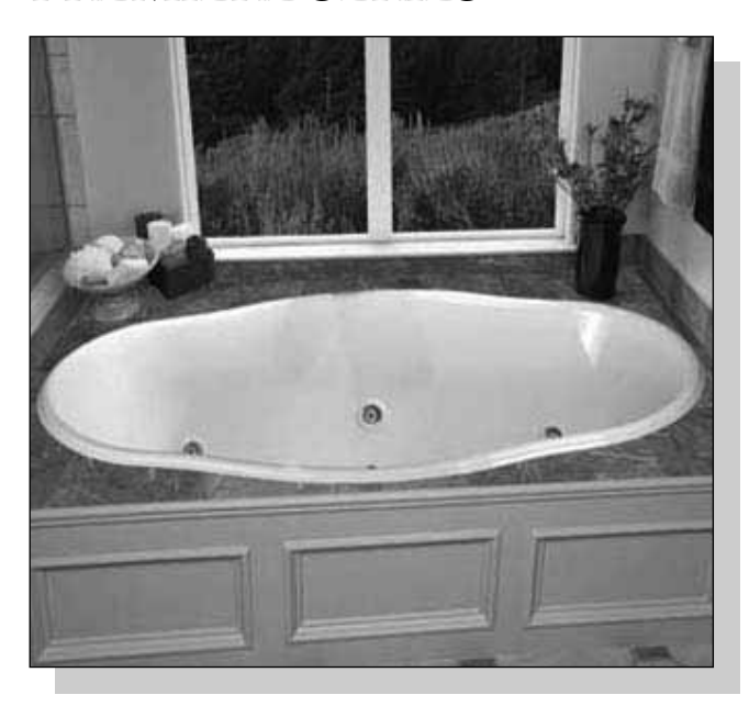
Preston Whirlpool (015-3705). Bath waste not included.