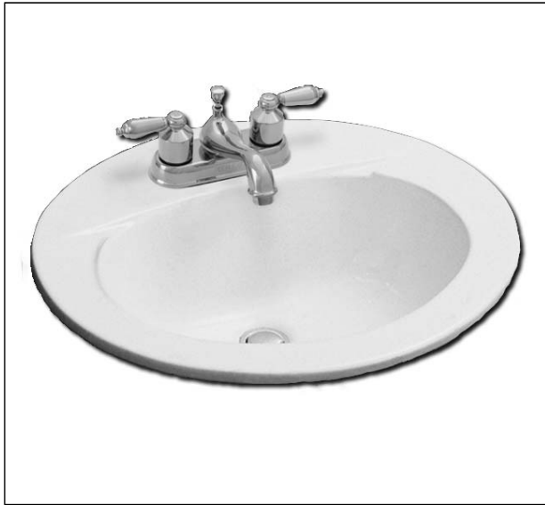
Murray Oval Lavatory (051-0124). Faucet shown not included.

NOTE: Eljer assumes no responsibility or liability for local or state regulations which deviate from national standards. It shall be the responsibility of the installer to comply with local codes and standards prior to installation of any Eljer product.